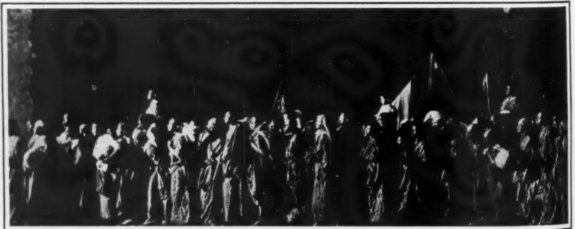
“Out of the land of Egypt; out of the House of Bondage”